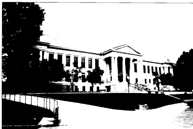
The Park building located on the University of Utah campus is made of white oolitic limestone from Sanpete County.

Willard, Box Elder County, showcases several homes made of field, or rubble stone. Most of the older homes (early 1850s to mid-1880s) were built with the stone found on or near the construction site. The source of these stones is granite, gneiss, schist, quartzite, and silicious limestone bedrock weathered out of Willard