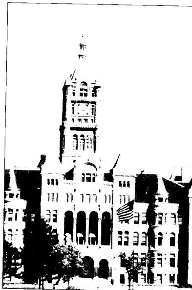
Built in 1894, the Salt Lake City and County Building was constructed from sandstone quarried near Kyune, Utah.